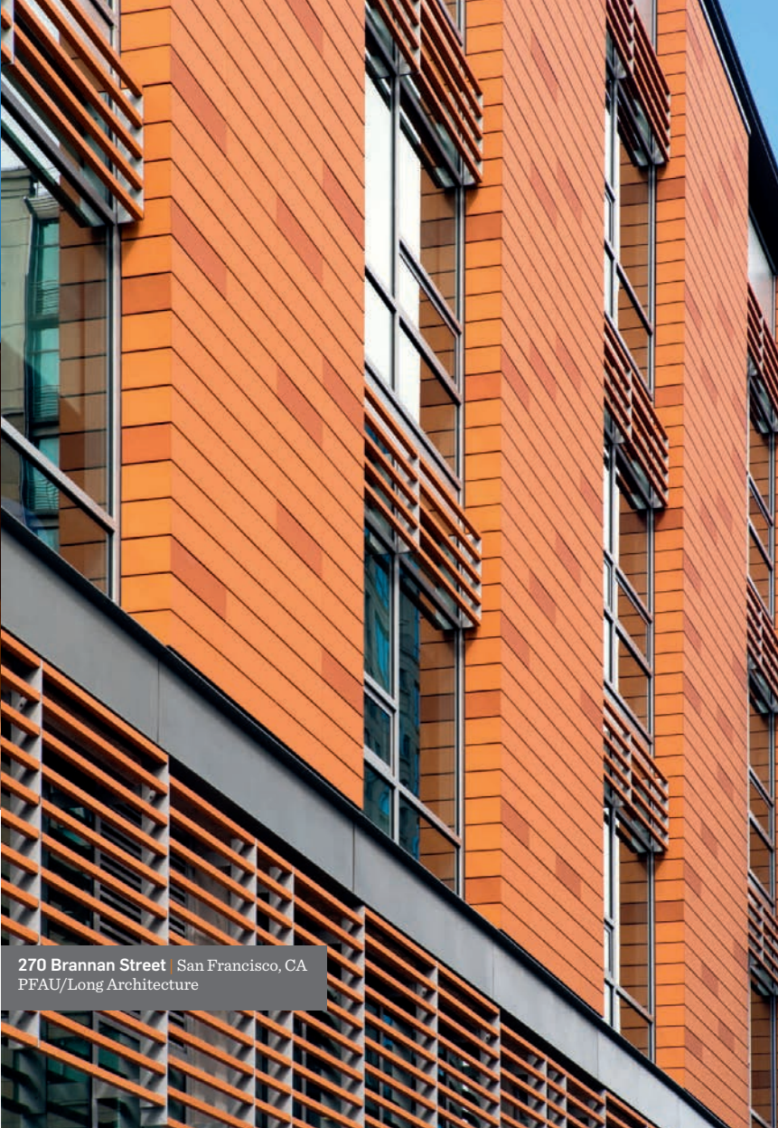
270 Brannan Street San Francisco, CA PFAU/Long Architecture