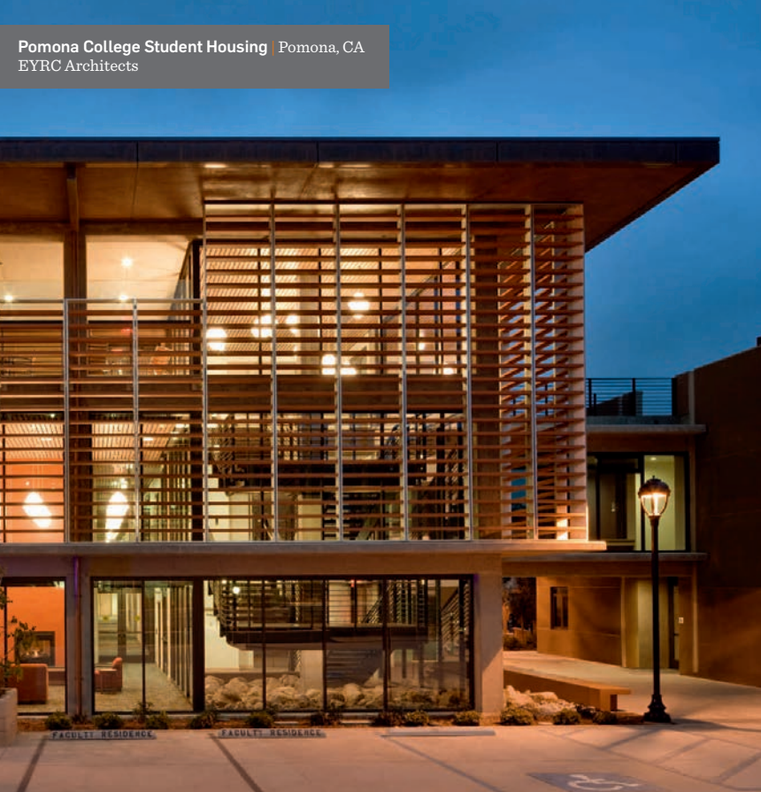
Pomona College Student Housing Pomona, CA EYRC Architects