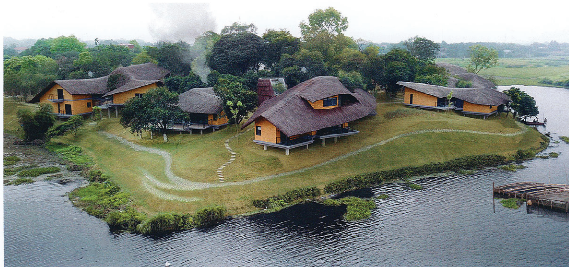
Jackfruit Village 2018-2019