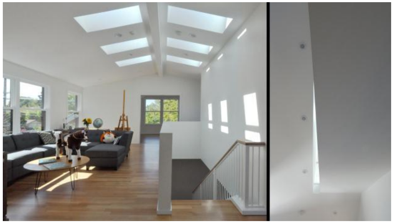
OFFICE 52 Architecture: House C, Portland, Oregon_2015. Photos courtesy of OFFICE 52 Architecture.