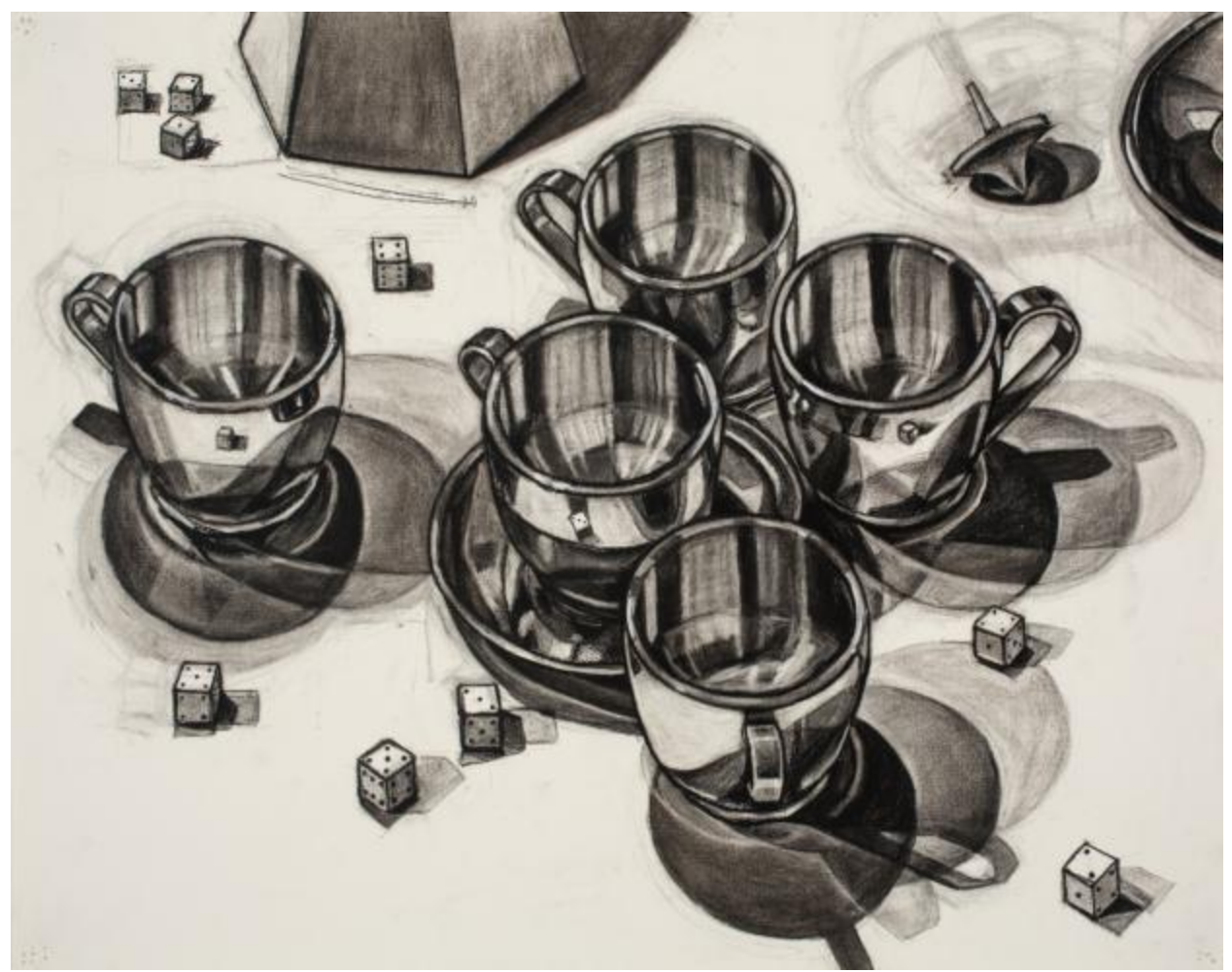
"Stainless Steel Cups and Dice," charcoal drawing on Strathmore series 400, 19" x 24," by Michelle LaFoe.